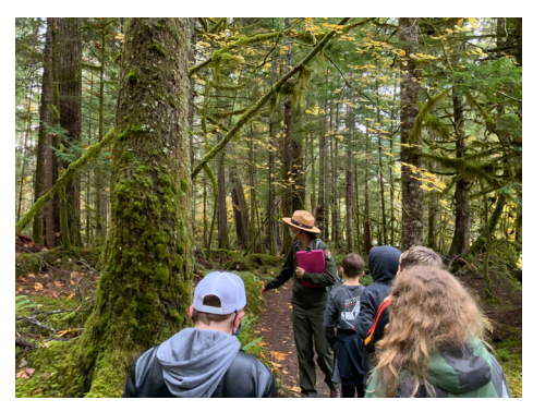
Darrington Elementary School students learned the importance of protecting native plants in the North Cascades on a fall field trip made possible by WNPF donors.

The Food Sustainability and Native Plant Education pilot program at North Cascades National Park began as a dialogue several years ago on how to reach populations the park doesn't serve as much as it would like – including local gateway communities, underserved youth, and