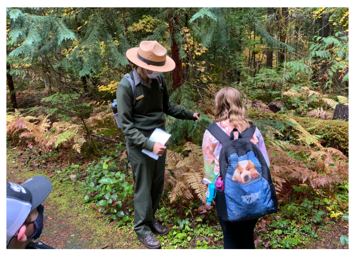
Thanks to you, Darrington Elementary School students learned about forest ecosystems in the park.

Later in October students took a field trip to the park to learn about native plants and natural food systems. There, they were introduced to the mission of the National Park