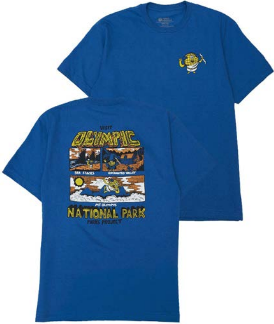
Visit Mt. Olympus Tee by Parks Project