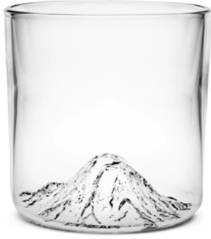
Mount Rainier Tumbler from North Drinkware