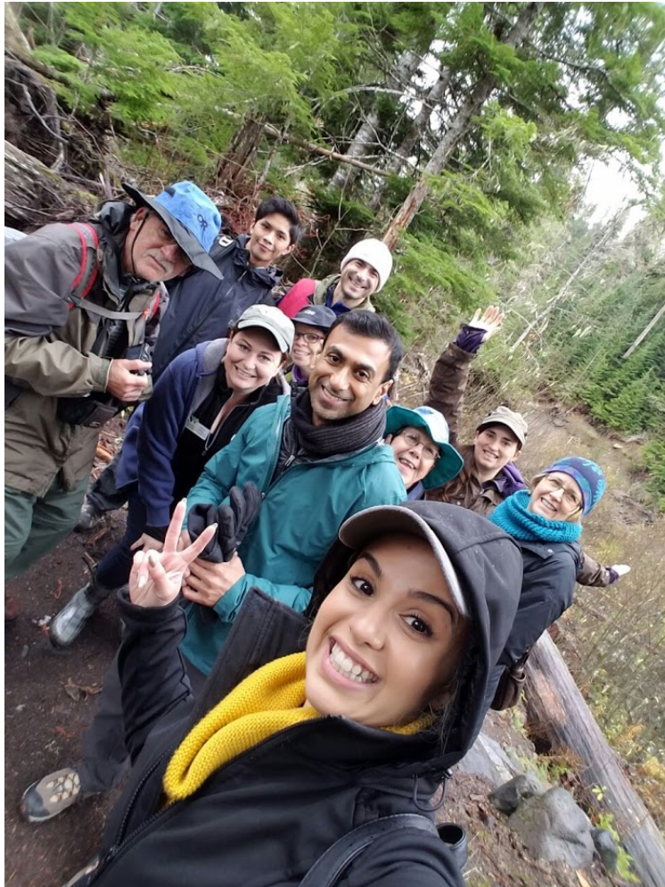
Rainier Fireside Circle folks on a hike.