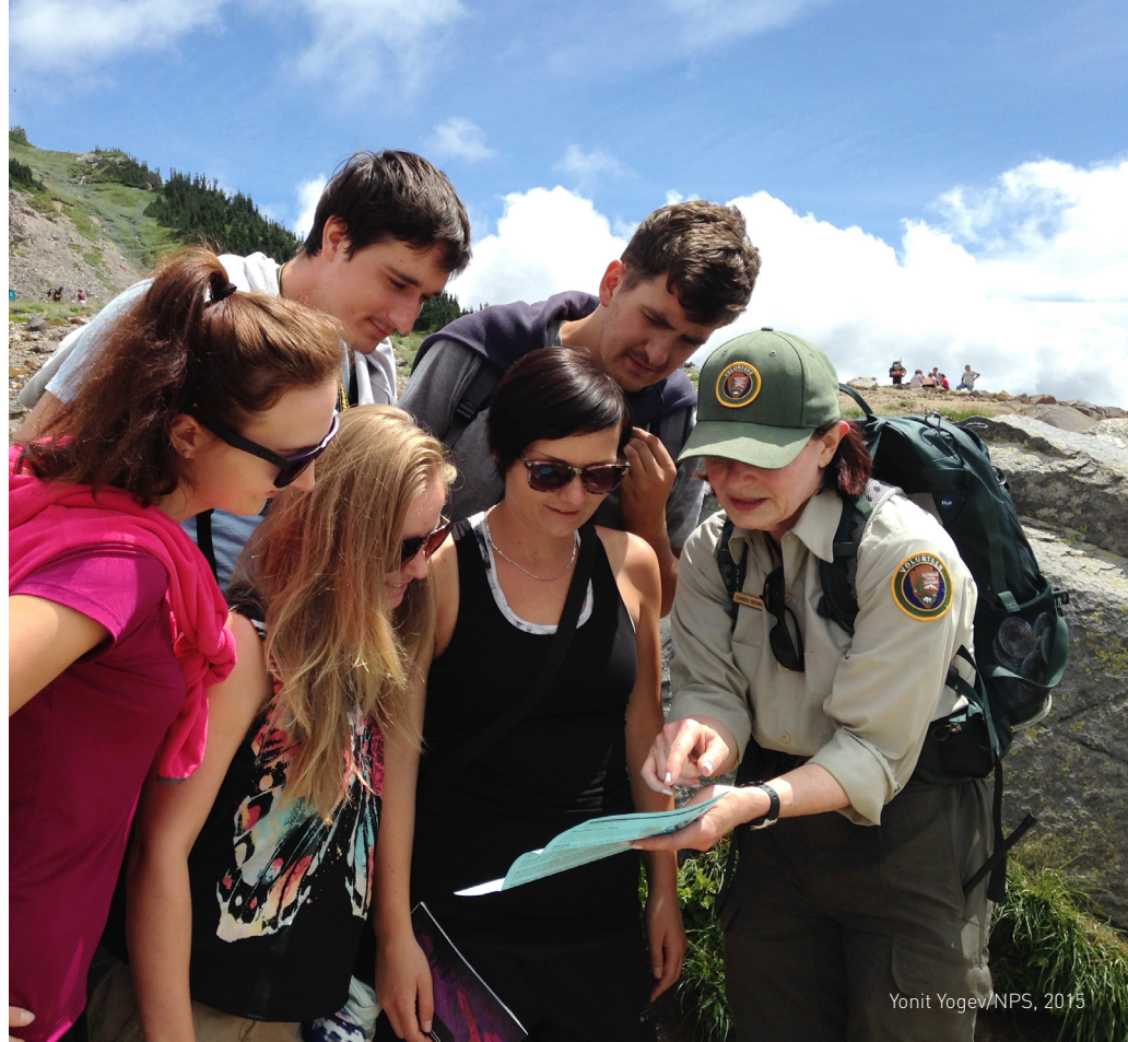
Yonit Yogev/NPS, 2015

Not able to participate in the Auction? No problem—you can also support these projects by making a donation at wnpf.org/donate .