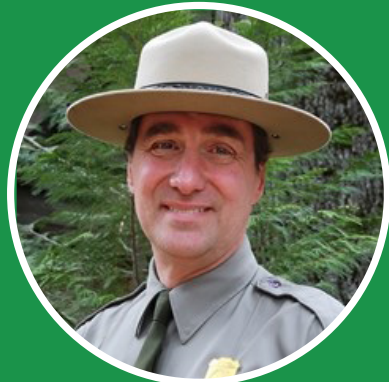
–Chip Jenkins, Superintendent, Mount Rainier National Park

“Washington’s National Park Fund’s virtual field trips are the perfect antidote for Wednesdays at 12 noon. Take a virtual hike to your national parks, join in on a reading about junior rangers, or walk a mile in a park scientist’s boots. To learn more, go to wnpf.org/field-trips .”